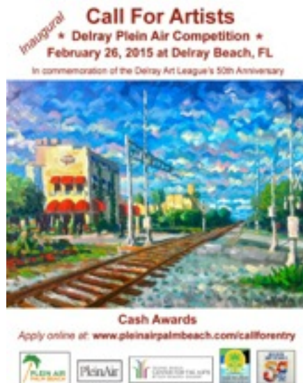
Painting by Ralph Papa

Ralph Papa- Plein Air Opportunities Northwood University is hosting a juried plein air exhibition of Palm Beach paintings at their campus in W. Palm Beach Nov. 14 - Feb. 23, 2015. Reception Feb